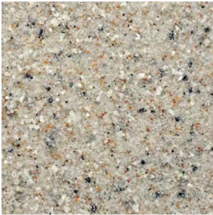
30165 Sandy Bottom