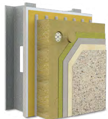
StoTherm® ci Mineral with Sandy Bottom finish