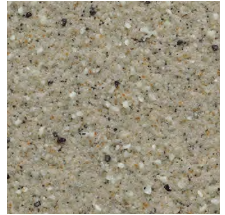
30156 Light Pepper