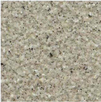
30155 White Slate