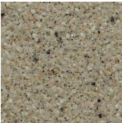
30166 Melon Gray