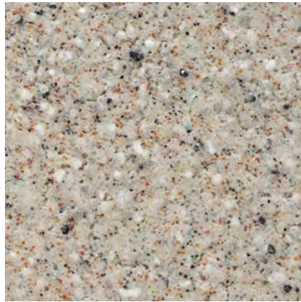
30164 Hallmark Gray