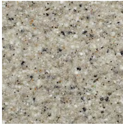
30167 Fresh Flint