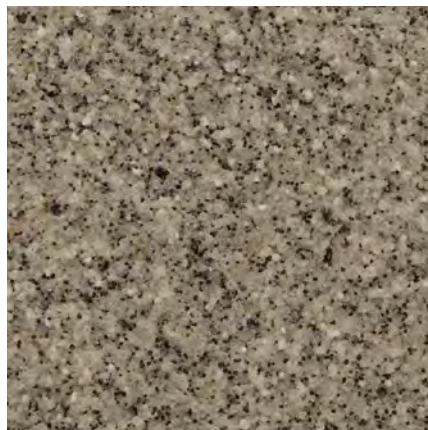
30163 Rich Pewter