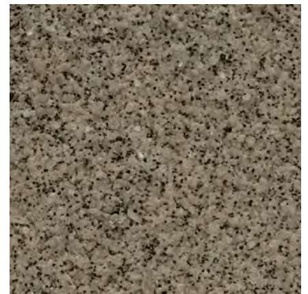
30161 Dusk Gray