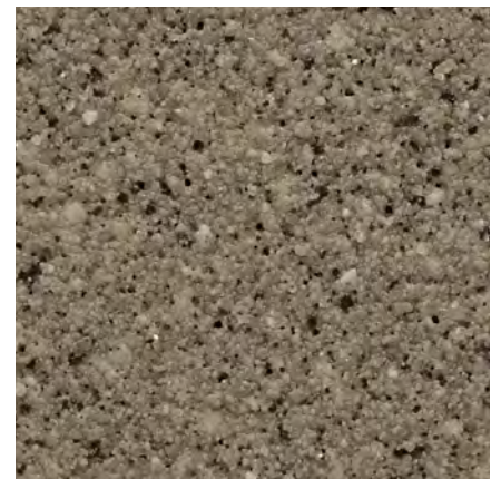
30160 Chimney Hill