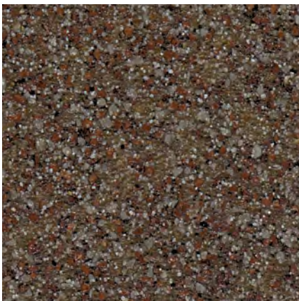
30173 Cold Spring