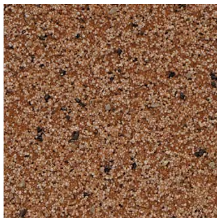
30171 Santa Rosa