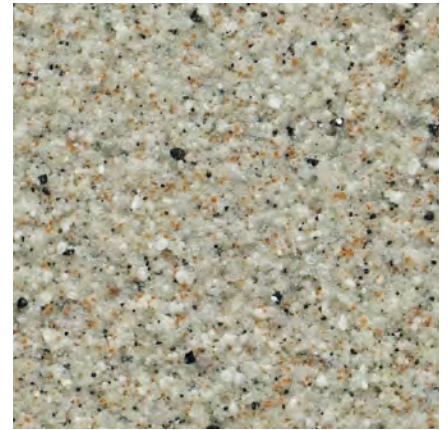
30157 Apricot Chalk