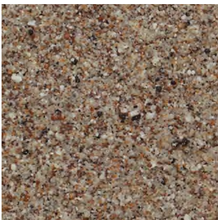
30152 Shallow Water